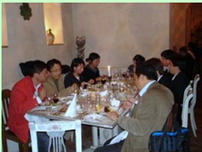
Delegates enjoying dinner at Virkarka Restaurant.