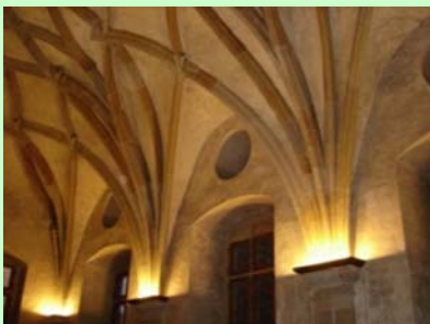
Interior of a portion of the Prague Castle.

Right: Participants in post conference tour of Vienna and Budapest.