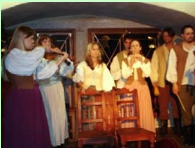
Traditional Czech musicians perform at final night's dinner.