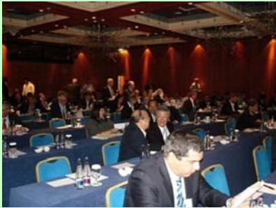
Conference delegates at Monday's General Session.