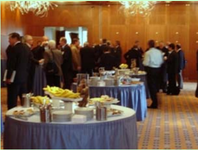
Delegates enjoy Continental Breakfast.