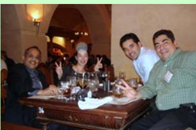
Delegates enjoy final night's dinner at Vikarka Restaurant.