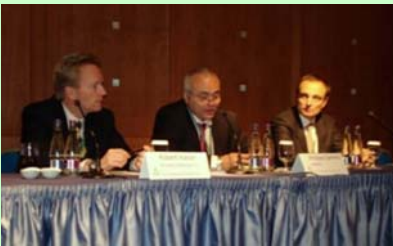
Q & A Session with Tuesday's Speakers.