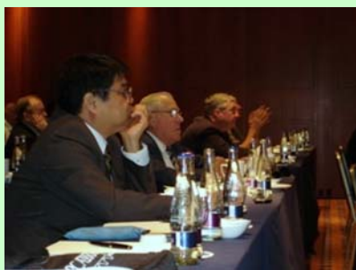
Delegates at Tuesday's General Session.