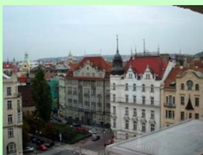
View of the City of Prague from the Terrace of the InterContinental