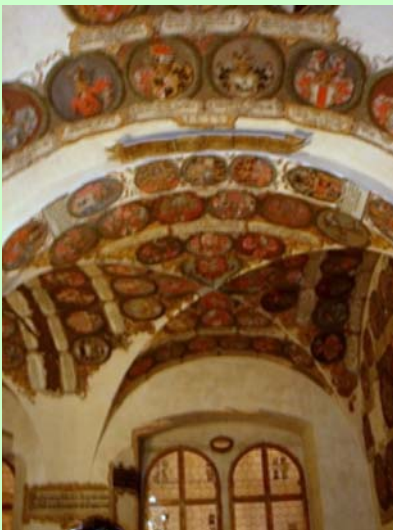
A view of the interior of the Prague Castle.