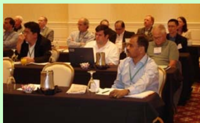
Attendees at Thursday's General Session