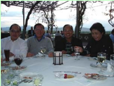
First time attendees from Indonesia