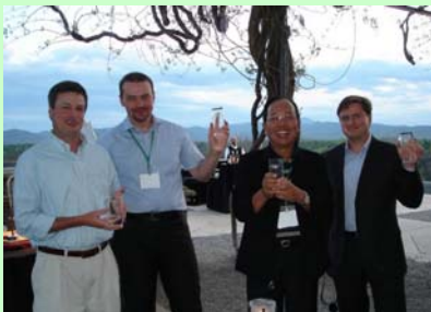
Winners of the golf prizes