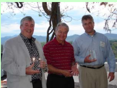
Winners of the golf prizes

The production of methyl esters for Biodiesel was the biggest increase in fats and oils usage. An estimated 700 million gallons of Biodiesel was produced in the US. Around 34% of the feed for Biodiesel came from refined soybean oil, 31% from crude soybean oil, 11% from inedible tallow and grease, and 24% from other fats and oils.