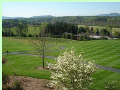
Springtime at the Biltmore