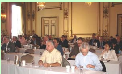
Delegates at Monday's General Session.