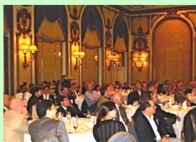
Delegates at Monday's lunch.