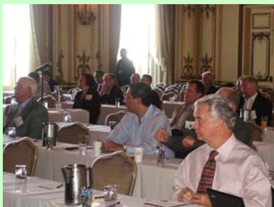
Delegates at Tuesday's General Session.