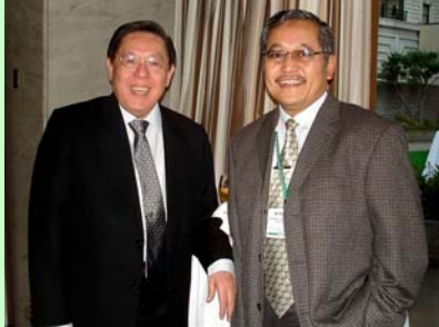
Delegates and Guests at Tuesday night's reception.