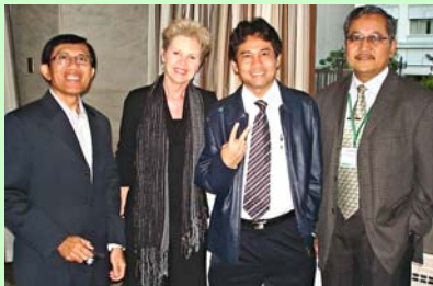
Delegates and Guests at Tuesday night's reception.