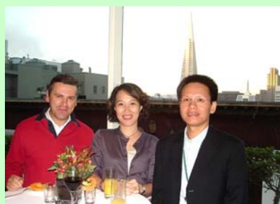
Delegates and Guests at Tuesday night's reception.