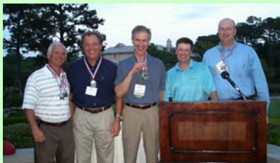
Golf prizes are awarded.