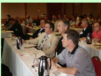
Friday's business meeting.