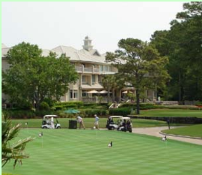
The Inn at Harbor Town.