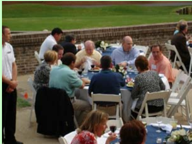
Buffet Dinner on Wednesday evening.