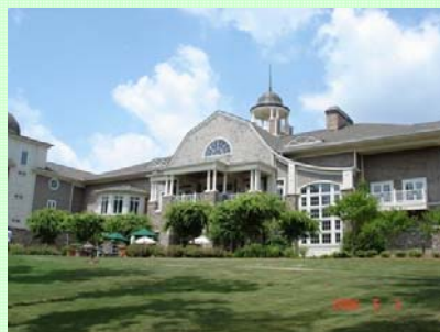
The Ritz Carlton Lodge