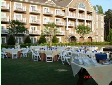
Opening Reception & Buffet on the Lawn