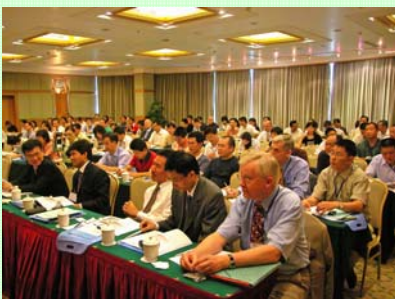
Delegates to China Gum Rosin Trade Conference.