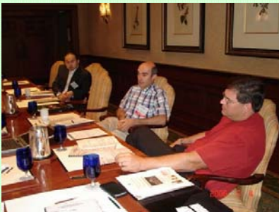
Membership & Information Committee Meeting