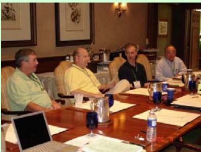
Meetings Committee Meeting